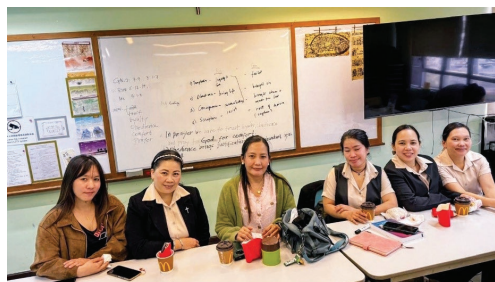
The Collectors Ministry embracing words of wisdom through Bible Sharing with STEC.