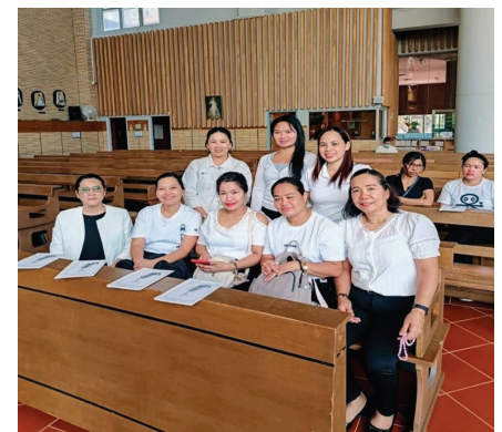
The STEC – Collectors family prays together, stays together, during the Rosary Gath-ering inside the St. Thomas Church.