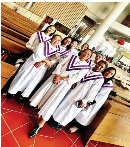
Music Ministry - "Christ is risen! Let us rise with Him, carrying the light of the Gospel into every corner of the world."