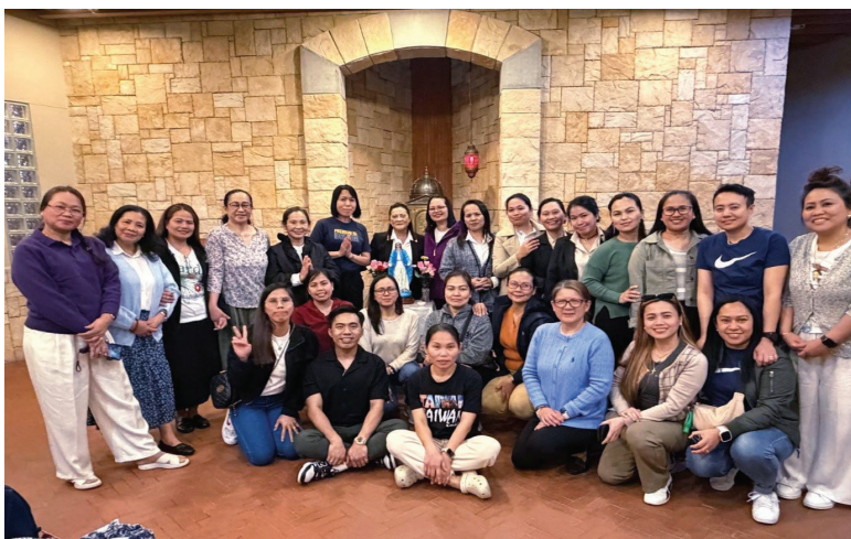
The STEC continually pray the Holy Hour, Divine Mercy and Holy Rosary, every 2nd Sunday of each month at 3:00 PM at the Blessed Sacrament Chapel. Everyone is invited to join us.