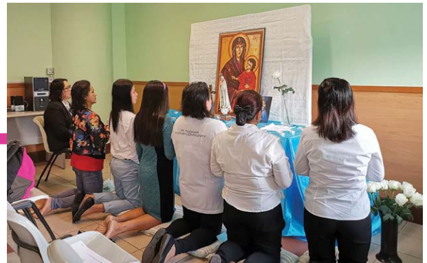
2000 Hail Mary Devotion