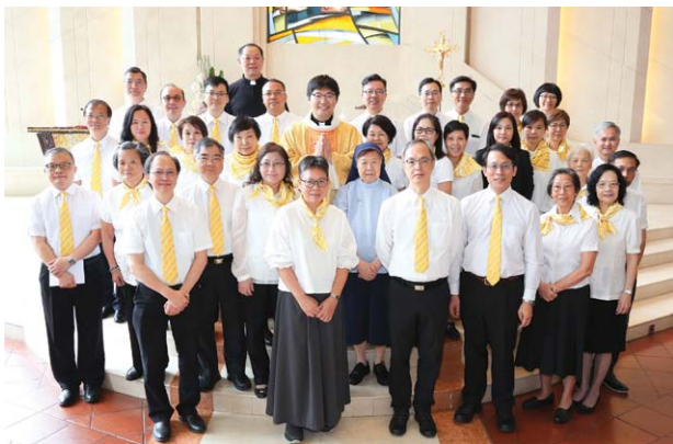
6月23日送聖體員派遣禮