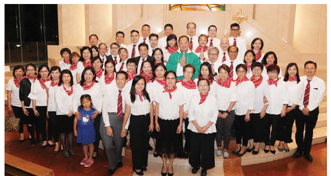
9月28日聖言宣讀會派遣禮