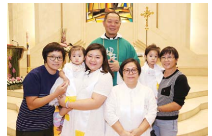
10月26日成人嬰兒領洗